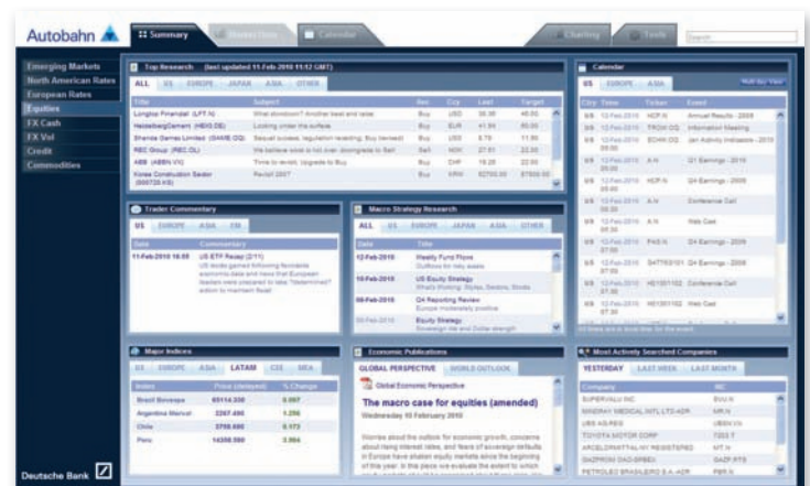
Fig. 1.1 Insight main view

Note: For access issues, contact the dedicated Insight Support desk (the numbers appear at the end of this guide)